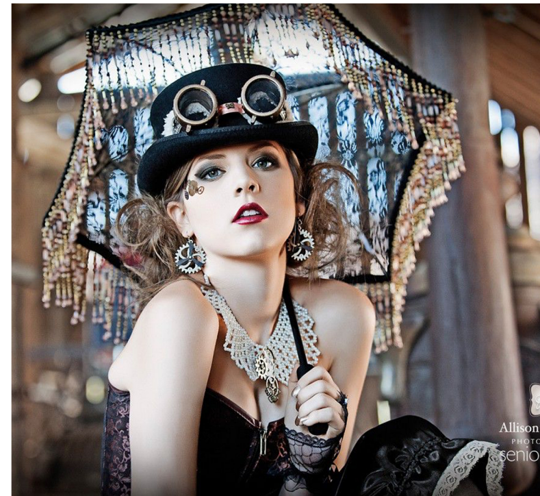
HAIR & MAKE UP